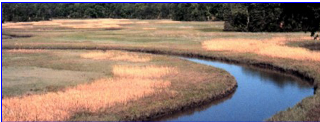
Featured NERRS Estuary: Chesapeake Bay Virginia National Estuarine Research Reserve